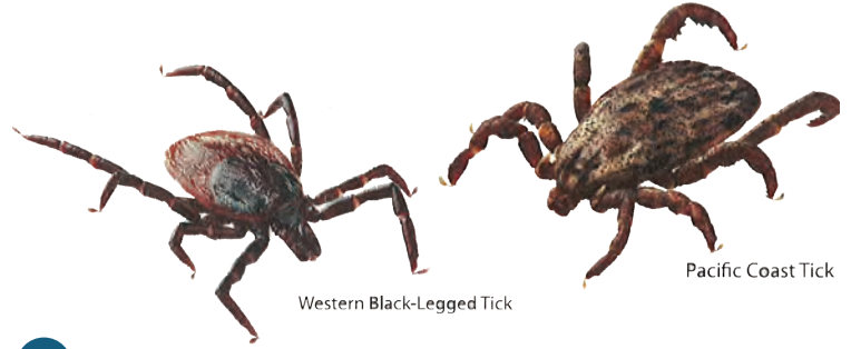
Western Black-Legged Tick